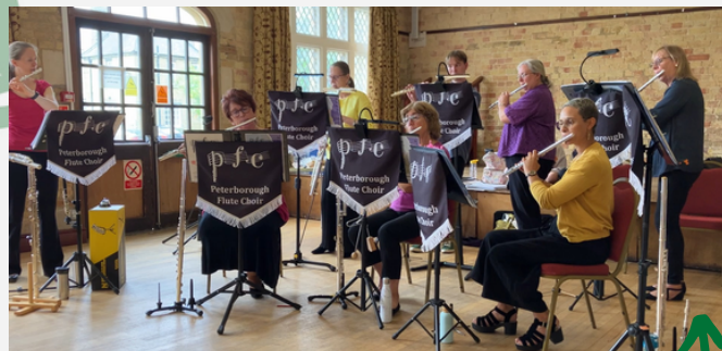
We had a great time performing and attempting the Thorney WI's summer quiz, Dingbats and guess the stately home