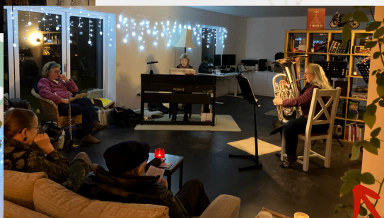
PFC's annual private soirée gives members a chance to perform solo or duets to each other