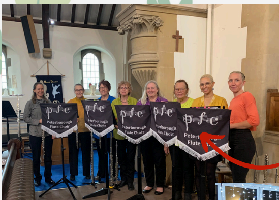
Post-performance grins as they've remembered that the gig is named "Bacon Buttie Fest"