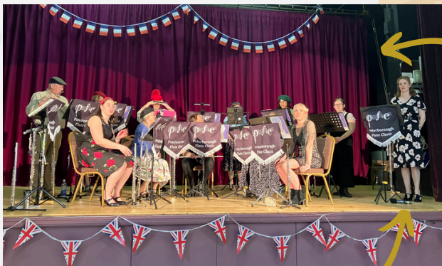
PFC is getting quite good at dressing up - here we're in our glad rags for Oundle's Vintage Fest