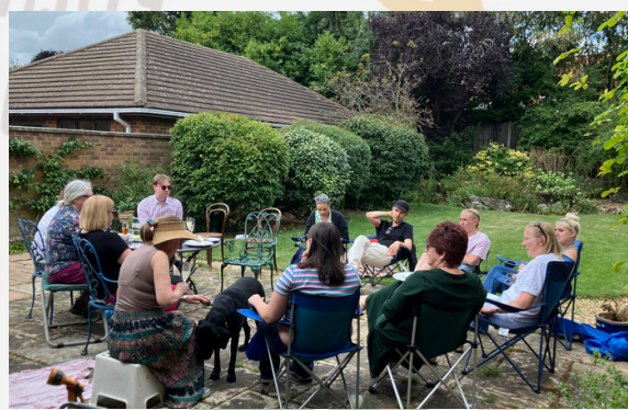
All work and no play... No, wait - All work and play and no eating makes flute players very sad, so we had a summer barbecue!